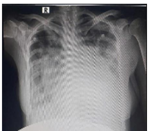
Figure 1. Chest X-ray shows cardiomegaly