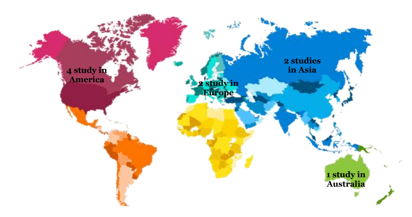
Figure 2. Map of the study area of the effect of cognitive behavioral therapy on mental improvement in Post Traumatic Stress Disorder patients

Tabel 1. Critical appraisal checklist for randomized controlled trial dari critical appraisal skills programme (CASP)