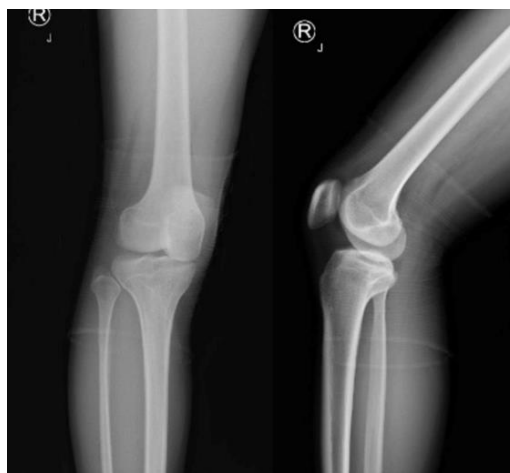
Figure 2. Anteroposterior and lateral standing x-ray of the right knee showed, widening of lateral joint space and increased concavity and subchondral sclerotic of the medial tibial plateau.