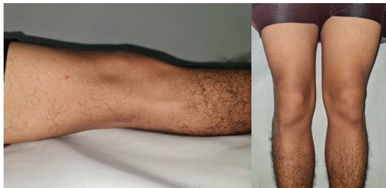
Figure 1. Clinical Picture of the Patient

assessment was 100%. The AOFAS assessment was 90% at 12-months follow-up and the patient presented good ankle motoric power with no complaint regarding the ankle function. The range of motion for both ankle eversion and first ray plantar flexion were not limited. The patient was unstable before surgery on the anterior drawer test, and Lachman's test indicated a score of +3. Post-operatively, the patient had negative results on Lachman's test and anterior drawer test. The patient had no complaint and satisfied with the result by radiograph (see Fig. 5).