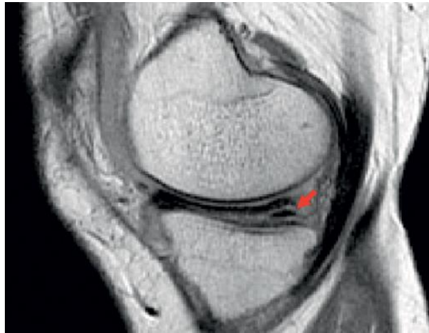
Figure 3. Magnetic resonance imaging of the right knee revealed, T1-weighted sagittal MRI of the right knee visualized medial discoid meniscus with a horizontal tear (confirmed by red arrow)