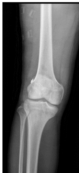
Figure 5. X ray of the right knee showed anatomical position.